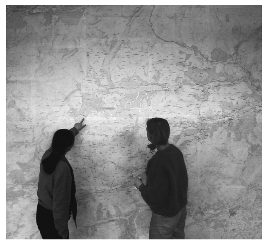
FIGURE 7.12 Comh-Chomhairle Bràghad Albainn (The Breadalbane Deliberation).

the return of the forest with the name for sheep (in the last fleece) produced on that land. Fiadh was a model of a deer 'exclosure' made of metal screen and wooden poles. This is a proposal for a work that would occupy a restoration site in the first years after a clear cut. Deer were described as a sacred animal in MacIntyre's poem "Beinn Dorain." Today deer are essential to the economics of Highland estates. Their presence has a significant impact on forest regeneration, native plants, and ecosystem. Deer fences would be the most common way to protect nature reserves and public forest from deer. Beside Caora and Fiadh many Gaelic vocabulary words were found that describe relationships to sheep and deer. Both animals were deeply embedded in the culture and natural environment in Scotland, but the meaning and their role in the social and economic life of people was constantly changing.