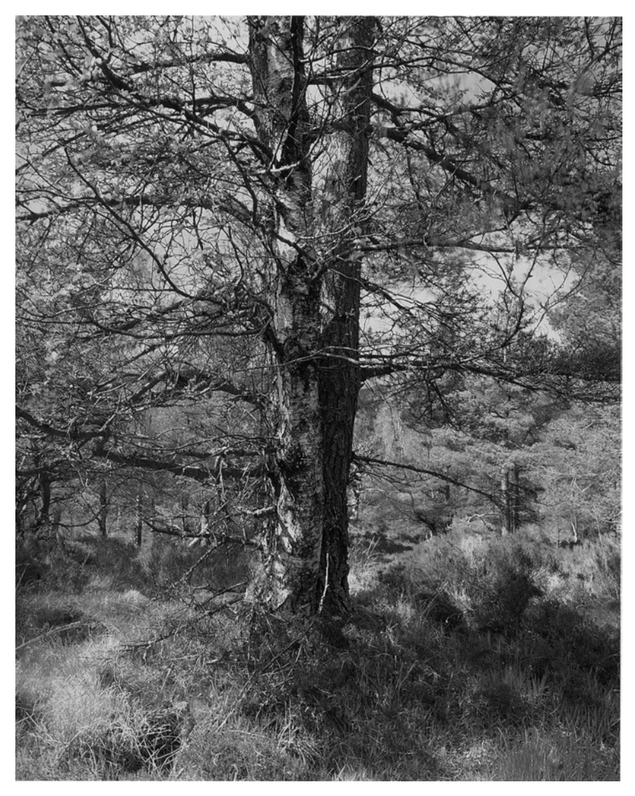
FIGURE 7.5 Detail of Figure 7.4, P.

V.M. Thom, an officer of the Countryside Commission, describes general views of a mature pine forest: "Anyone entering a pinewood finds that the trees, spacing, and light in a pine forest is satisfying to the eye" (1975: 101). There are many patches of mature pine in the Black Wood. As described above, we have experienced continuous pine forest not only in the Black Wood, but also in