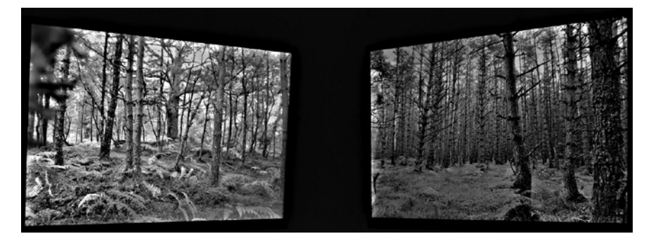
FIGURE 7.18 Am Beàrn Eadar Na Craobhan... - The Space Between the Trees...

(the Potato Patch described earlier), a single generation with a grassy understory. The other image showed a forest that was more aged and form-diverse with a rich understory of vegetation more typical of the Black Wood.