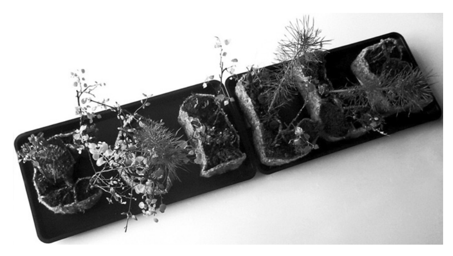
FIGURE 7.14 Detail of Coille Dubh Rainic – The Black Wood of Rannoch.

place names fading in and out of the image. A text on the screen describes the opportunities and constraints within the Black Wood. The other video piece is Am Beàrn Eadar Na Craobhan... – The Space Between the Trees... (Figure 7.18) that provokes an ethical and aesthetic consideration of two types of forest regeneration: one was showing a patch of trees that are tall and straight