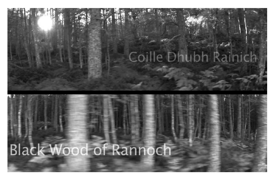
FIGURE 7.17 Tha a' Choille a' Gluasad – The Forest is Moving .