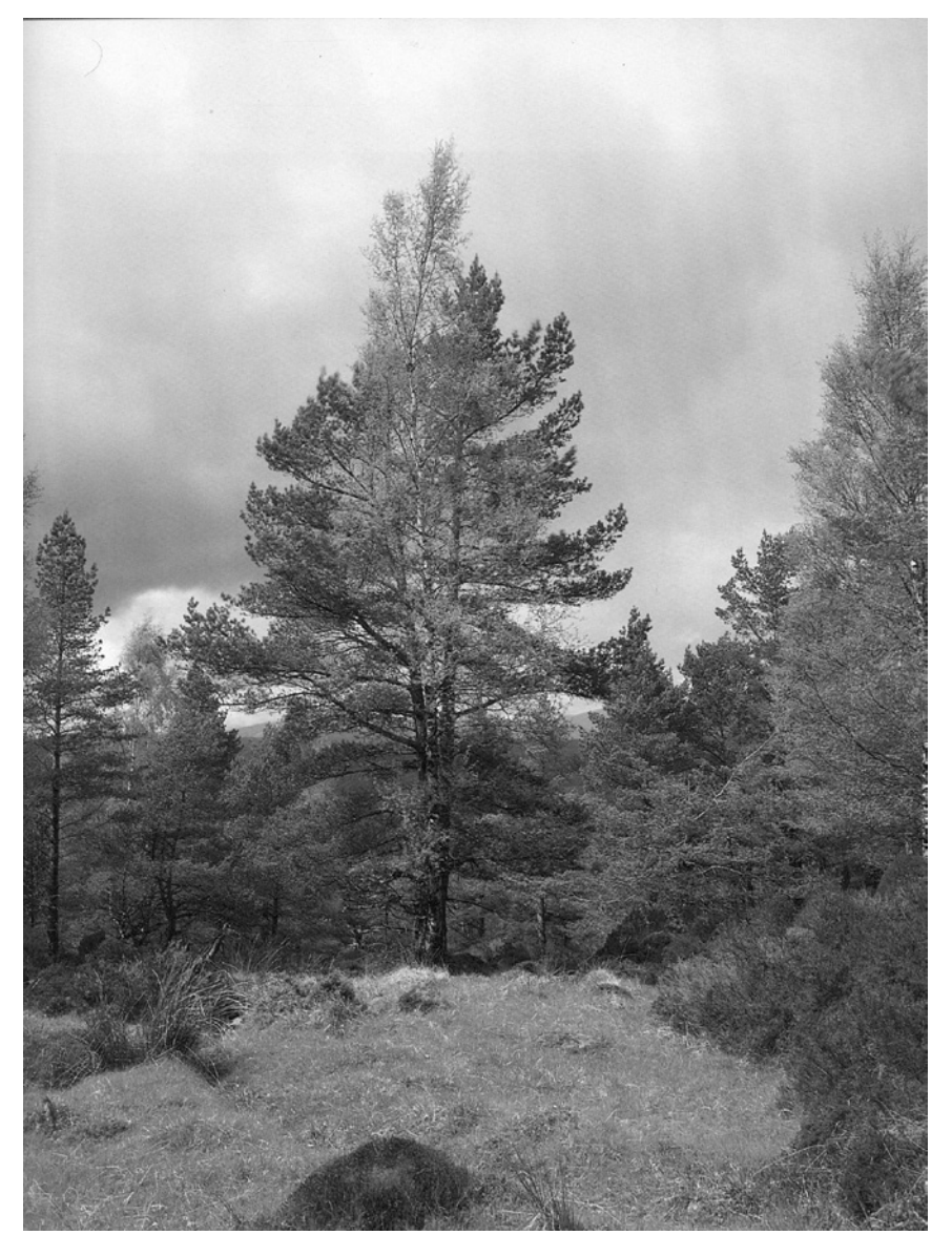
FIGURE 7.4 A birch and a pine are growing into each other in the Black Wood.