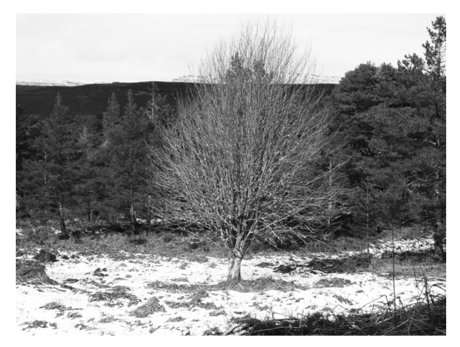
FIGURE 7.9 A vigorous rowan tree in the Black Wood.

that we have experienced. Hume's "cause and effect" is related to the forms of pine trees and the overall aesthetic perception of the 'condition' of the forest. We have explained these relationships in the sections on resemblance, contrariety, space and time, quality and numbers, identity, and degree. The question about biodiversity and the aesthetic/cultural appreciation of forests is introduced in the sections on contrariety and quantity and numbers, then directly discussed in the section on identity. If the aesthetic identity of the Black Wood is tied to its granny tree form and open canopy relationship, and its biodiversity form is tied to the same structural conditions then there are a set of questions that need to be examined regarding future forest plans for natural regeneration which would reduce both values. Within the three hundred years of a normal life cycle of the pine trees, human ideas about land, people, and nature have changed radically. There has been a cycle of decisions about goats, cows, sheep, and deer in the forest, and ongoing land management practices that have influenced the form of the Caledonian pine trees we see today and will see in the future. We have discussed the contemporary identity of the forest as 'wild' but also provide insight on the conflicted nature of that identity at least as the idea of 'wild' is understood in Rannoch. A tree form can be influenced by accidents caused by either humans or nature. We can imagine or