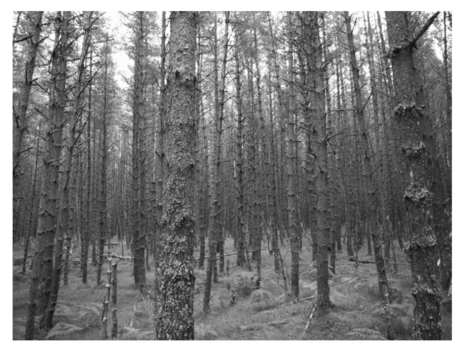
FIGURE 7.1 The Potato Patch in the Black Wood.

Regeneration of pine trees in the Potato Patch (Figure 7.1), described above in 'The first impression of the Black Wood', all share the same degree of resemblance. They all look to be of the same species, size, form, and age; they have the 'look' of a plantation forest, although there are no obvious planting rows. In other places such as Beinn Eighe (Figure 7.2) we find two trees that resemble each other like a mirror image twin. The impression of twin trees is that they have grown together and become balanced and harmonised. Their forms are different from tall, straight, and skinny forms that have been developed competing with each other in the shared environment. They seem to grow together closely and create symmetric forms through inter-relationship. In both of these cases, trees show some degree of resemblance but the qualities are different; one seems to seek harmony and the other seeks competition.