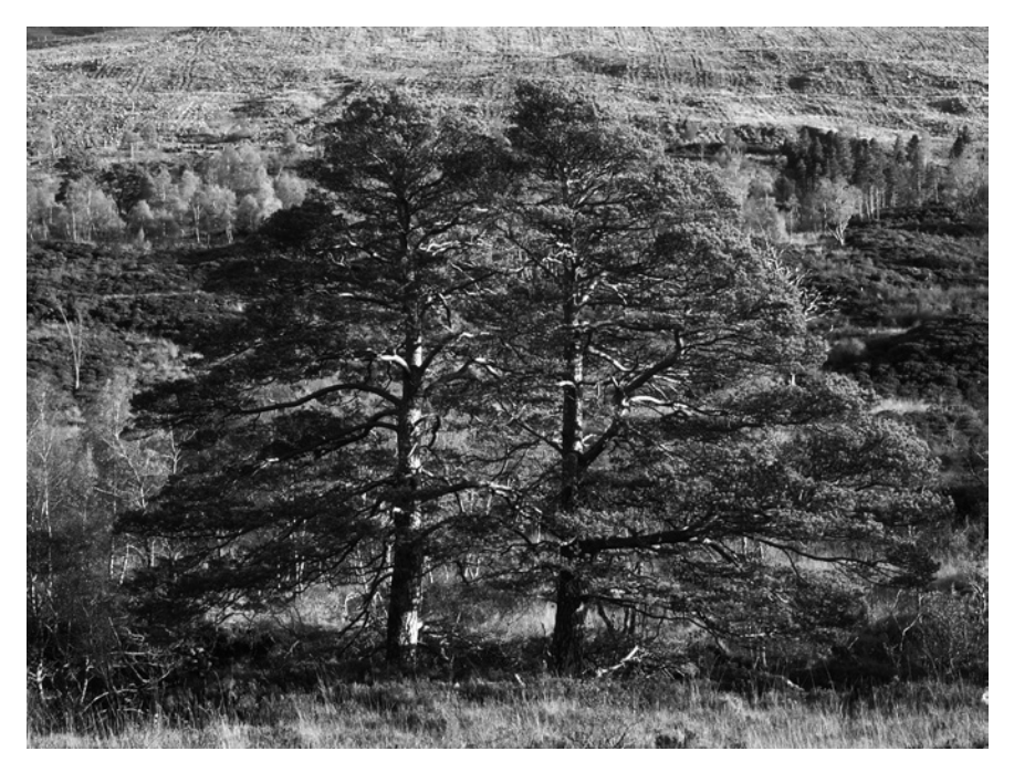
FIGURE 7.2 Twin pine trees in Beinn Eighe.

Trees cannot move around once they are placed in the ground. We have seen a young pine that grows too close to an old pine (Figure 7.3), where the younger tree trunk cuts into the older tree's lower branch. Deep in the Black Wood there is a pine and birch tree that have grown together and into one another (Figures 7.4 and 7.5). Two different species of trees have found a harmonious interrelationship, a visual reminder of the fundamental relationship (as described in the National Vegetation Classification for woodlands in the U.K.) between pine and birch in the Caledonian forests of Scotland.