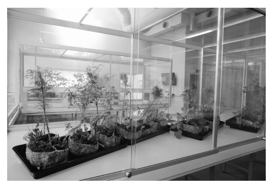
FIGURE 7.13 Coille Dubh Rainich – The Black Wood of Rannoch.