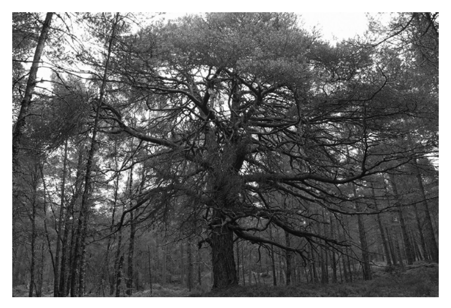
FIGURE 7.6 Granny pine in the young regenerated pine trees in the Black Wood.