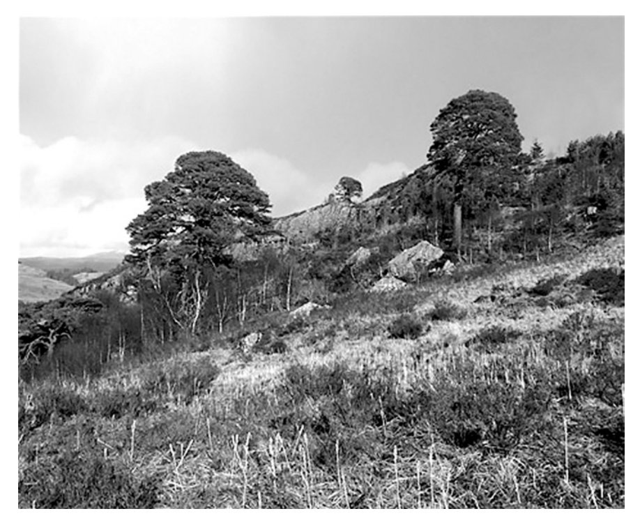
FIGURE 7.8 Clumped pine trees in Glen Falloch.

struggles; the trees embody some of these conflicts. In order to develop the lower branches, the tree must be getting full sunlight when they are very young; often this would mean that the understory was under significant grazing pressure from goats, sheep, cattle, or deer; later that pressure was removed. Or it can mean that trees were selectively harvested, the tall straight trees cut, leaving the twisted horizontally branched granny pines behind. We have wondered about the relationship between the evenly-aged young pines in the Potato Patch and a small group of older pine trees on the edge of that patch. We begin to imagine an open field that was replanted or possibly naturally regenerated by the seed thrown from a few granny trees.