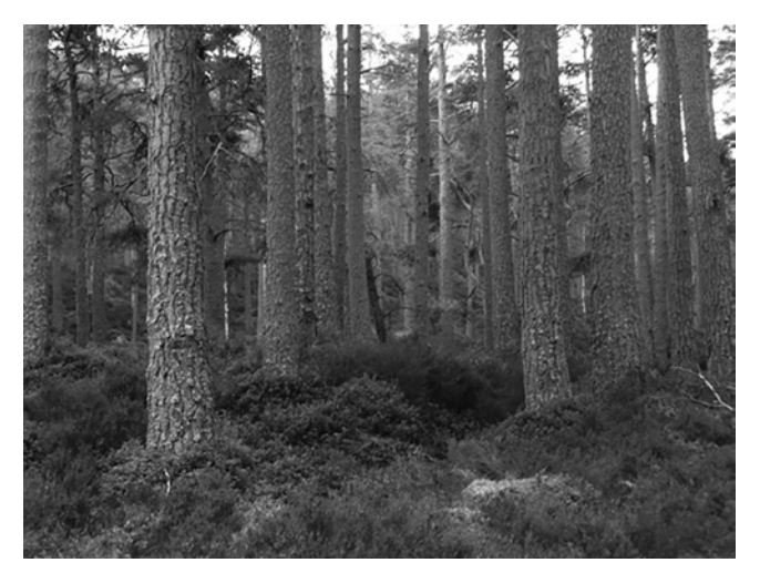
FIGURE 7.7 Evenly spaced pine trees in Ballochbuie.

forests such as Ballochbuie (Figure 7.7) and Abernethy. The 100- to 150-year-old pine trees are often straight and also do not have the large lower branches that granny trees have. Grannies are probably 250 to 300 years old and are spatially dispersed (Figure 7.8). The space between trees is related to what were often demanding times, periods of social and political unrest as well as economic