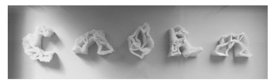
FIGURE 7.15 Caora/Sheep.