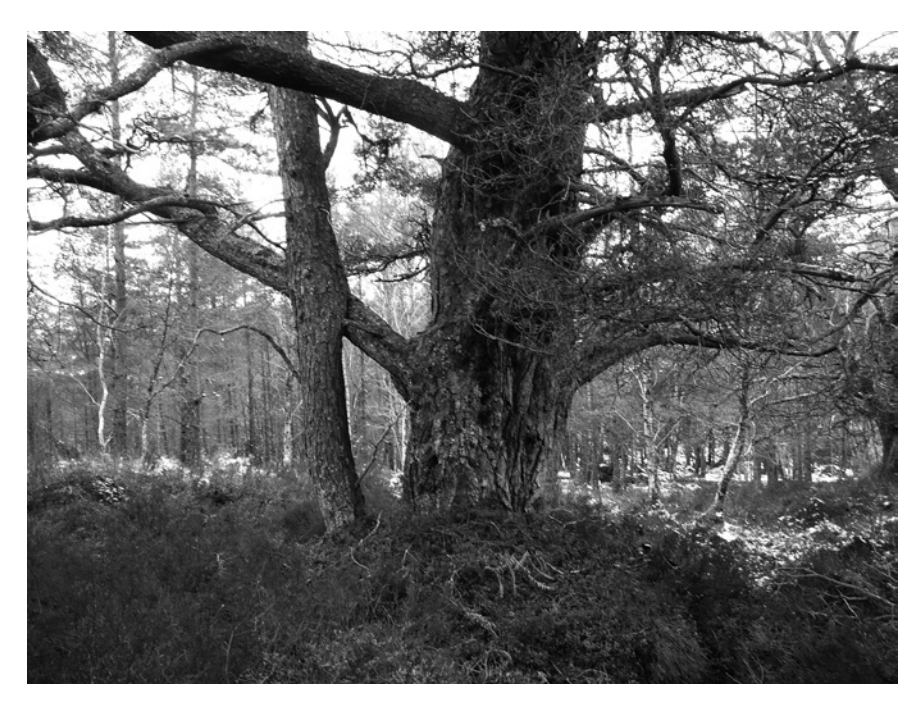
FIGURE 7.3 Two pine trees against each other in the Black Wood.

granny pine (Figure 7.6). Grannies are individual, large, and curvilinear; they have thick trunks with widely spread horizontal branches. Both are the same species of Pinus sylvestris . Arborists seek trees that are straighter and taller because of the simplicity of harvest and log/commodity values. In plantations, trees are planted closely together, so they compete for the light by growing vertically. Granny trees have less timber value, however they contribute to the biodiversity of a forest, by letting more light into the understory. They also have social value that can be talked about as visual, aesthetic, cultural, ecological, and spiritual, although some of these qualities can be found in a forester's plantings as well.