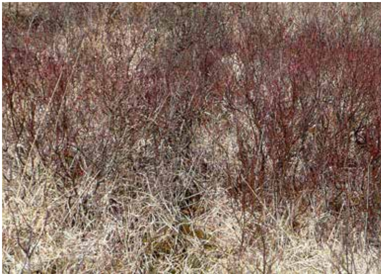
Photo: Birch saplings in the Loch Lomond and Trossachs National Park

During the walk Ruth Anderson, a member of the group showed Goto the robust bonsai-tree like stem of a native birch tree and its root structure. It supported new tree growth once sheep were removed (and deer fenced out) of that area of the new National Park. The removal of sheep from the Scottish landscape makes an enormous impact on trees and their ability to regenerate and prosper.